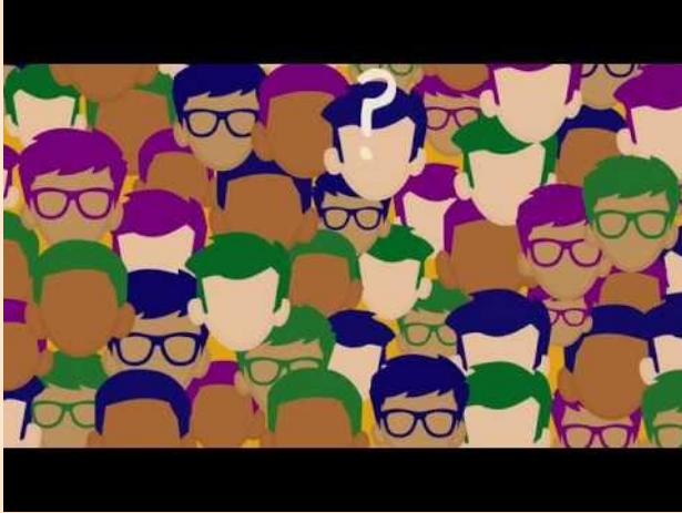
What Boys Want to Know About Puberty