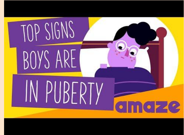
Top Signs Boys are in Puberty