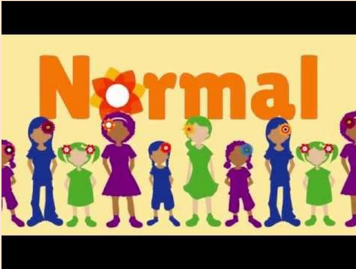
Am I Normal? Girls and Puberty